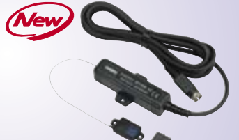
9742-10 (detachable model)

Refer to the optical sensor specifications for further details.